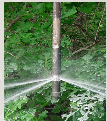
Pressure-Activated Injection Probe: How it Works

Geoprobe® Injection Probe in action. Four-Port, 360 degree horizontal injection for top-down or bottom-up injection